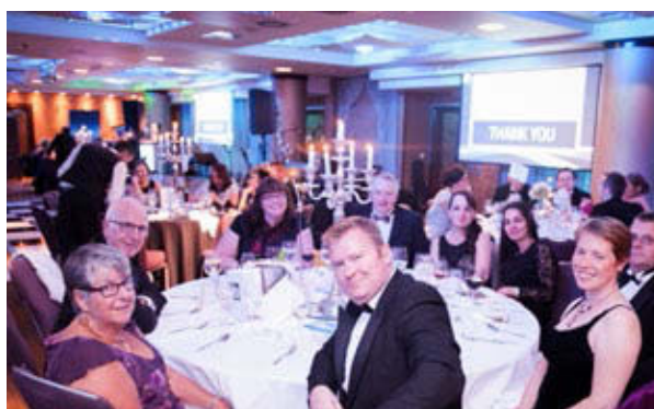
Autism Jersey's 10th anniversary ball