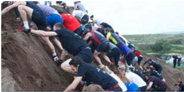
The Sandstorm Challenge contributed more than £4,000 through sponsorship