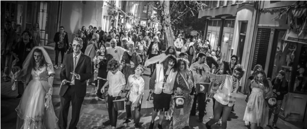
The Zombie Walk at Halloween continues to be a popular event in the calendar

To celebrate our 10th anniversary year we organised an Awesome Ball at the Royal Yacht Hotel. The spectacular evening showcased the extraordinary abilities and talents of those who are affected by autism. We previewed our Awesome video featuring five individuals with autism sharing their talents. The ball raised an incredible £17,000 through ticket, raffle and auction sales.