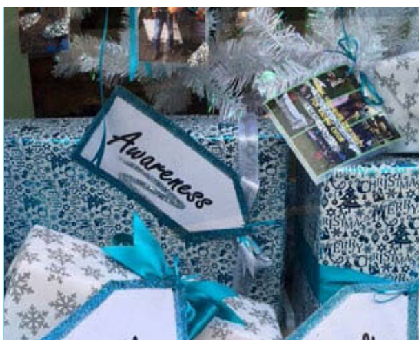
The shop window won the medium-sized shop category in the St Helier Christmas window competition

We were delighted to be winners for the second year running of the medium-sized shop category in the St Helier Christmas window competition. It is great to be recognised but we hope it raised awareness about autism and how we would like people with autism and their families to be treated.